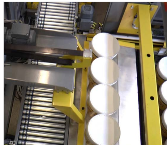
See the MK4 pallet loader in action here