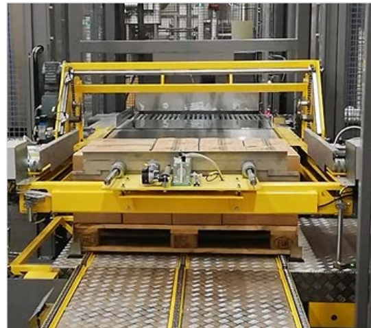
See the MK3 in action here